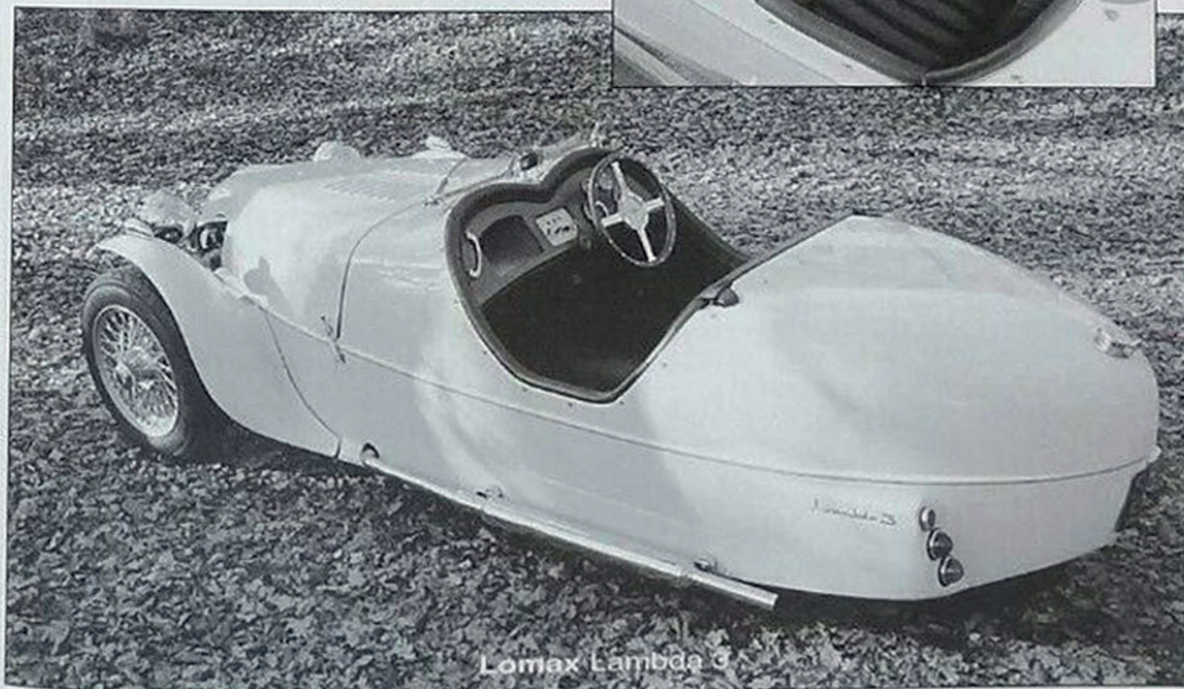
Lomax Lambda 3