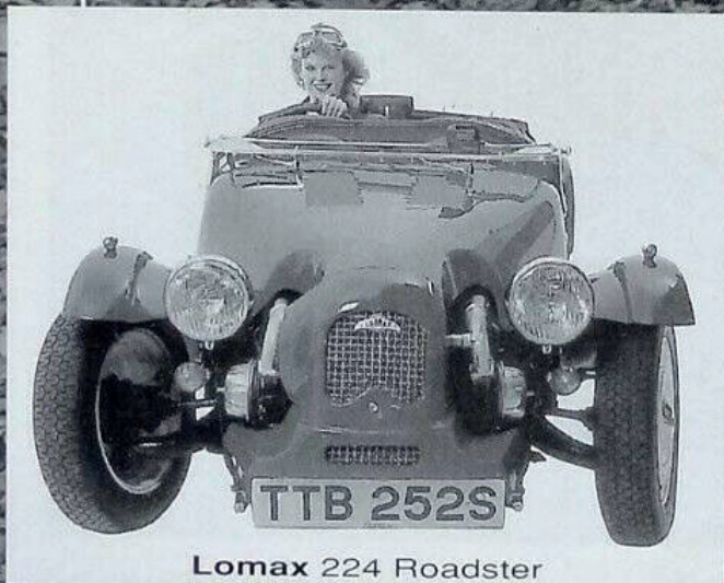
Lomax 224 Roadster