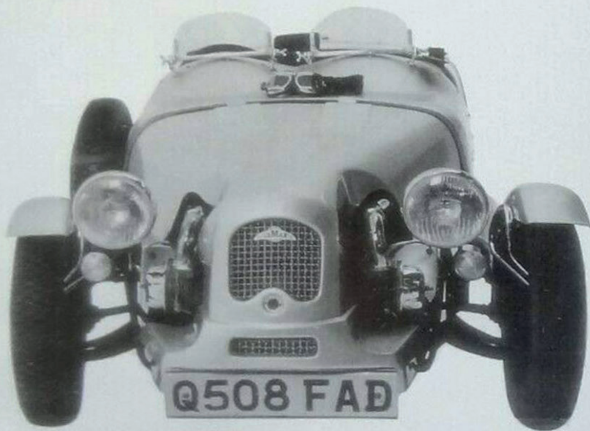
Lomax 224 Roadster

In common with all the Lomax range, the 223 / 224 three and four wheeled models require components from one low cost and readily available donor car or from Lomax works. Low insurance (group 1) and low tax on the three wheeler add to the pleasure of ownership