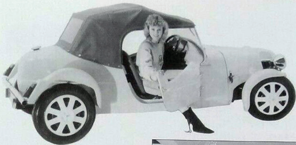
Lomax 224 Sports